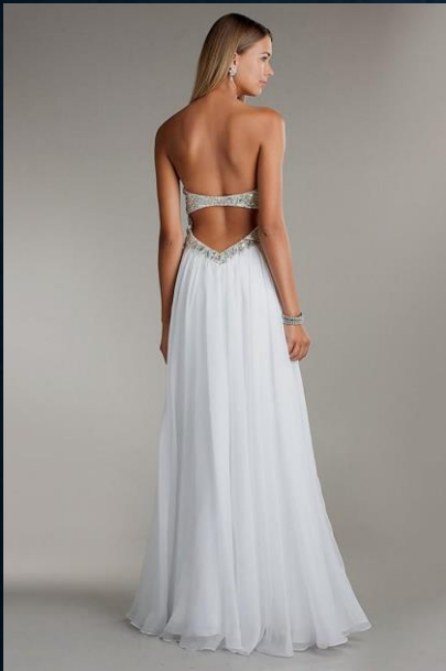
Meets dress code

DRESSES MAY BE BACKLESS AS LONG AS THEY ARE NOT CUT BELOW THE NAVEL OR SHOW THE CREVICE OF THE BACKSIDE.