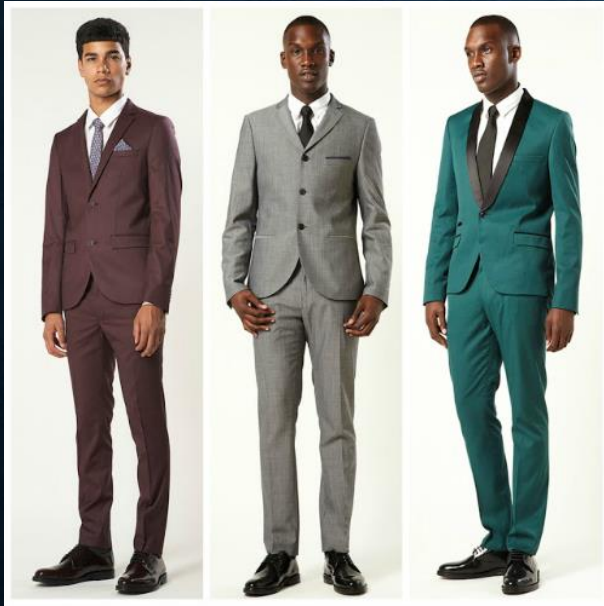
Meets dress code