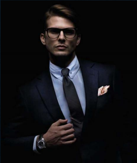
Meets dress code